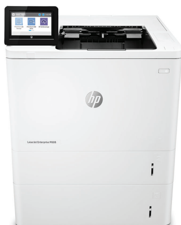
HP LaserJet Enterprise M608x