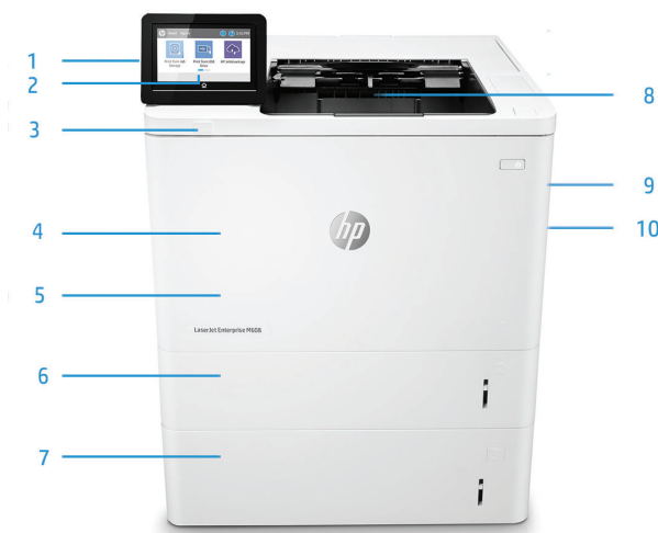
HP LaserJet Enterprise M608x