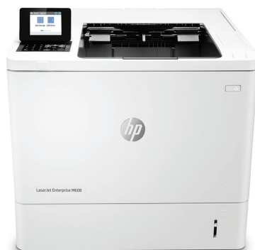
HP LaserJet Enterprise M608dn